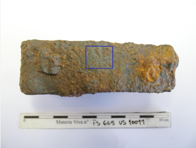
Fig. 3: Artefact after restoration, the blue square indicates the detail of Fig.4,