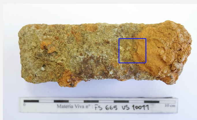
Fig. 5: The blue square indicates the location of the analysed area by binocular observation,