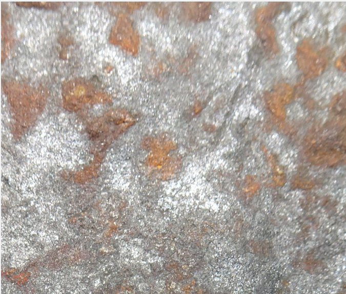
Fig. 4: Detail of the cleaned surface showing shiny grey/blue surface and red/brown spots,