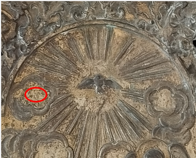
Fig. 4: Location of the top part of the back side with indication of XRF analyse (red circle),