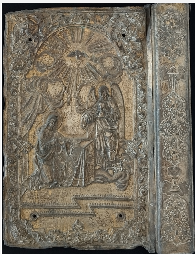
Fig. 1: Binding (of a religious book) representing the Annunciation scene (back side and spine). Dimensions: L=47cm; l=30cm + W spine: 8cm.