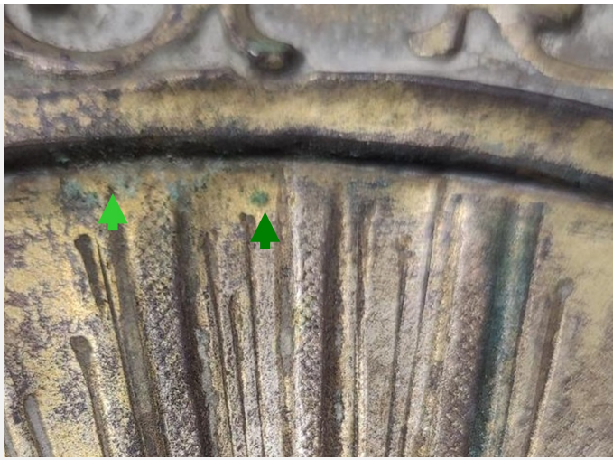
Fig. 3: Location of areas observed: light green compound (light green arrow) and dark green (dark green arrow),