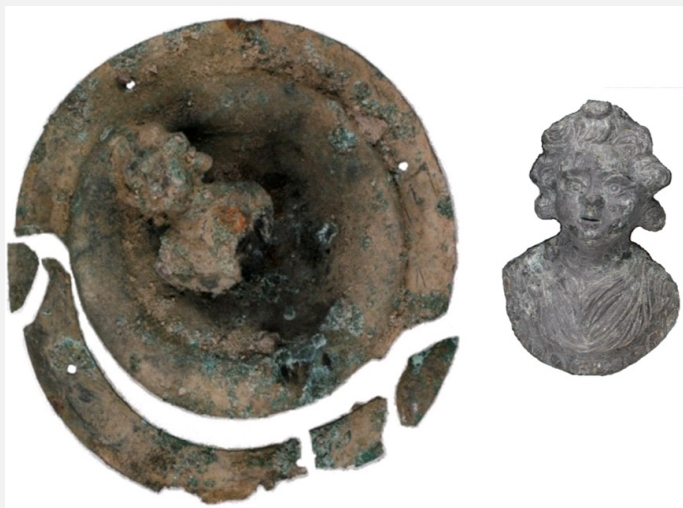
Fig. 1: Bust of an applique as found (left picture) and the bust (right picture),